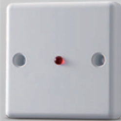
AH-01313 UL pending