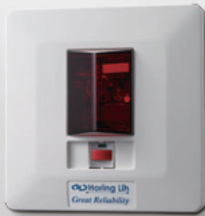
AH-91213 CE approved